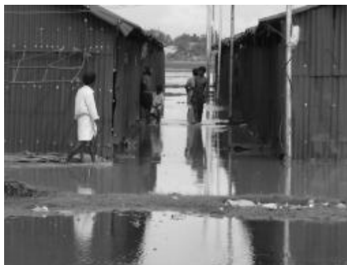
Tsunami temporary shelter in Kannagi Nagar, Chennai

The quality of drinking water these coastal villages get, usually from non-piped sources, is severely compromised by the 267 million liters of sewage (partially treated/untreated) discharged daily into the city's waterways. The Adyar and the Cooum rivers, the Otteri channel, and the Buckingham canal—all crucial sources of water in Chennai—have become open-sewage conduits. The stagnant waters breed disease and cause germs, leading to a variety of waterborne diseases. Chennai accounts for nearly 70 percent of the urban malarial cases in Tamil Nadu.