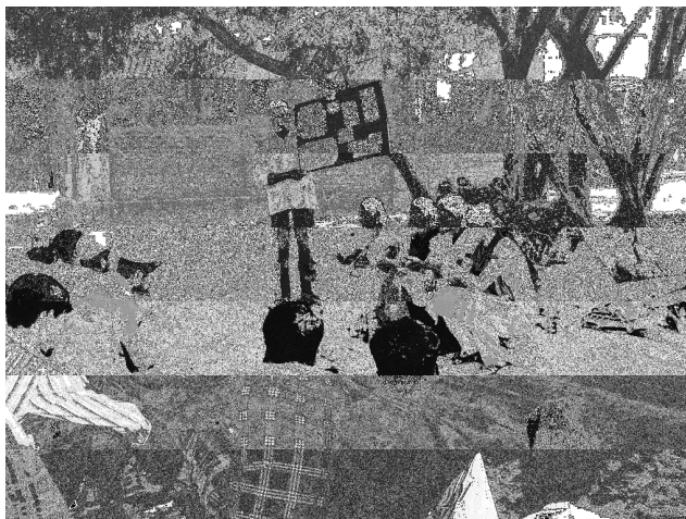
One of the health activist taking training for community